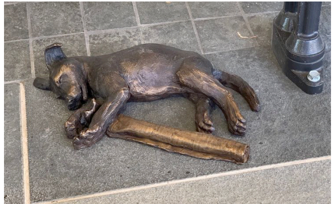
Smarts Butchery Pup: Snags