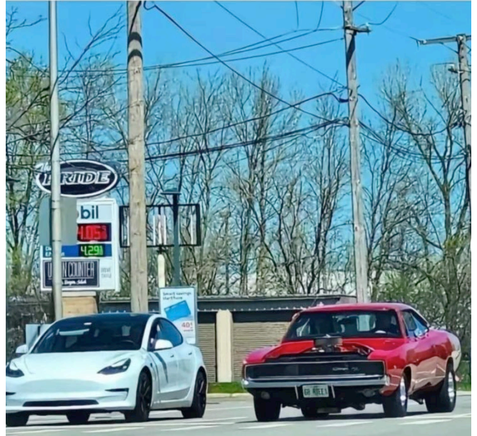
Found on Facebook

Sorry. But 50 years down the road, NO ONE IS GOING TO RESTORE A TESLA. 🤔 🦠